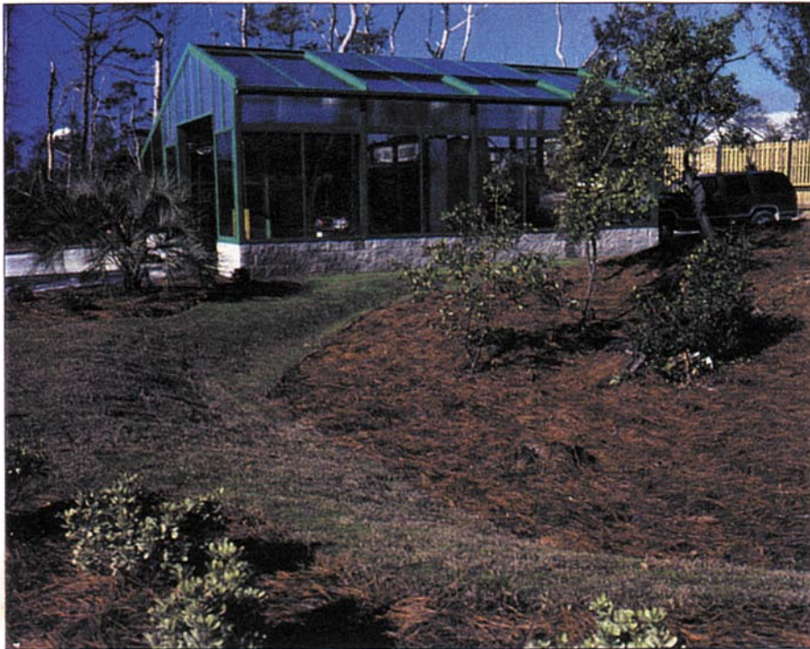
The state-of-the-art glass Island Pro Wash recently opened in Emerald Isle, NC.

A new concept in carwash construction has one community talking.